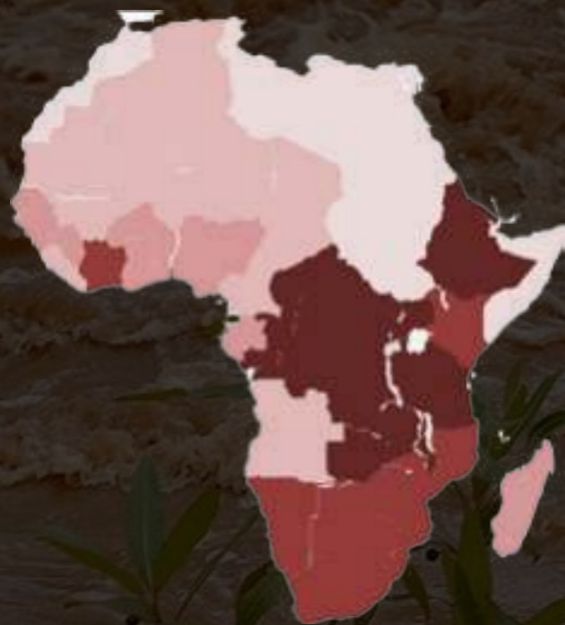
Darker shading represents countries where deaths resulting from climate change are highest, lighter shading where they are lowest.*

The largest declines in agricultural yields within Africa are anticipated in central South-ern Africa (Zambia, Zimbabwe, Angola)