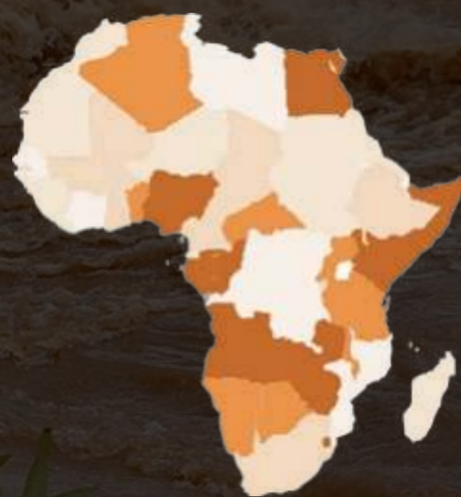
Darker shading represents countries where productivity reductions resulting from climate change are highest, lighter shading where they are lowest.*

South Western Africa is expected to see a decrease in water availability of more than 10 per cent as a result of climate change*