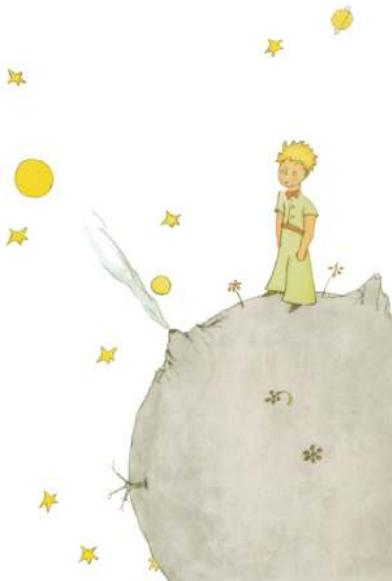
The Little Prince on Asteroid B 612