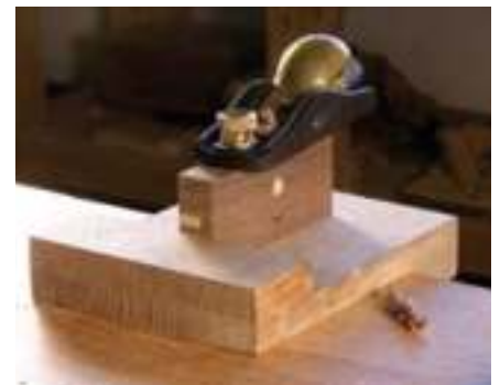
Shoot edges. The fence of your bench hook is a great planing stop when sizing small pieces. The only limitation is the thickness of the fence. It needs to be thinner than your stock. If you are going to shoot like this a lot, I'd make your fence 5/8" thick instead of 3/4".