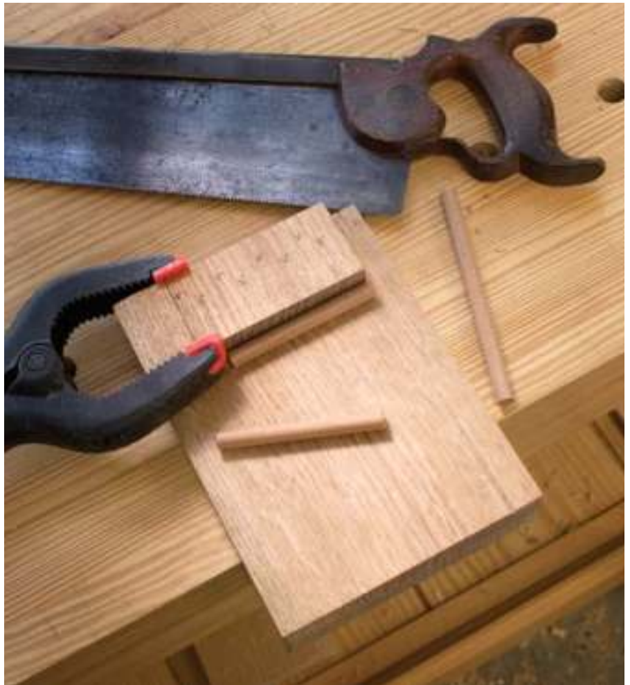
Get hooked. Bench hooks make your handsawing safer and more accurate. After working with one for a couple weeks, you will wonder how you ever got by without it.

Early bench hooks were made from one piece of wood. The bed, fence and hook were all sawn from a single piece of thick stock. Later bench hooks were made from three pieces of wood, but the grain of the fence and the hook were at 90° to that of the bed, so your bench hook could self-destruct (thank you seasonal expansion and contraction) before the appliance got completely chewed up by your saw.