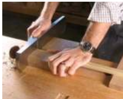
Shoot ends. Flip your bench hook over to use it as a small shooting board. A heavy plane with a sharp iron makes this easy. A block plane with a dull iron makes it almost impossible.